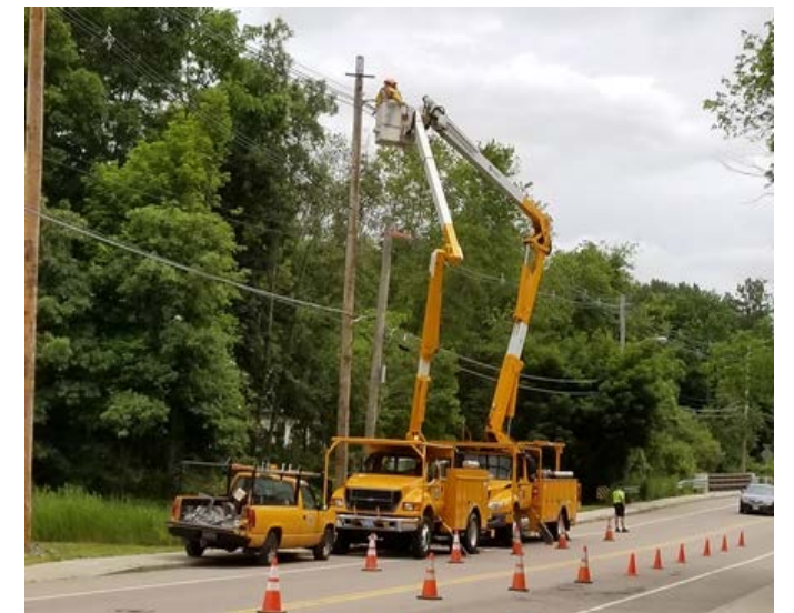
Electric Dept. Prepping for Pole Transfer