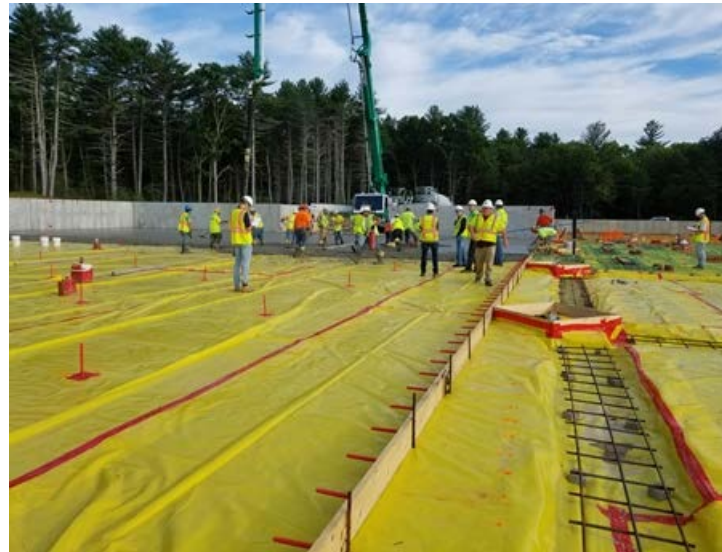
Vehicle Storage Floor Placement

DPW Footings and Walls completed. Floor Slabs placed. Metal Building in progress. Phase I Site Work nearly complete.