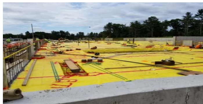
Vapor Barrier Under Floor Slab