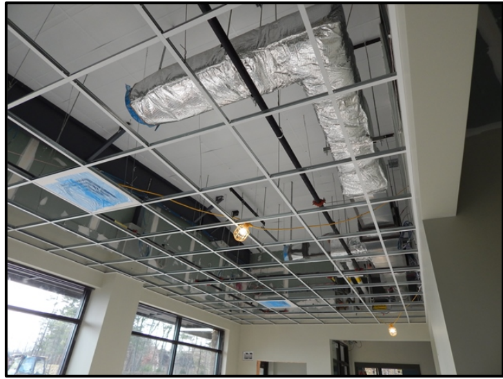
Acoustic Panel Ceiling Systems Installation Begins.