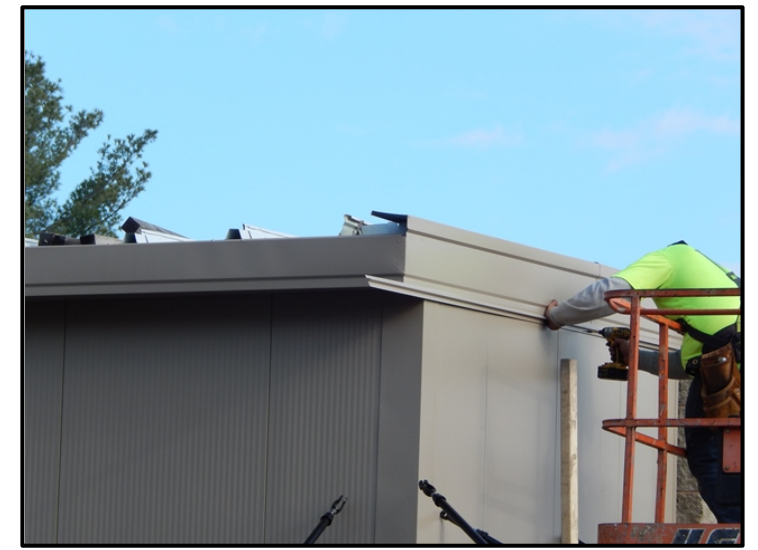
Finishing Touches on the Building Envelope.