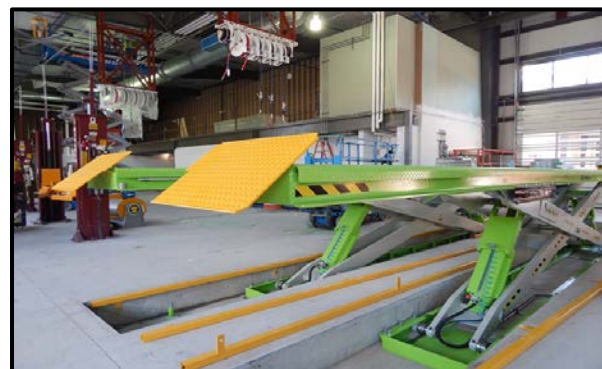
Scissor Lift Installation in Maintenance Garage.