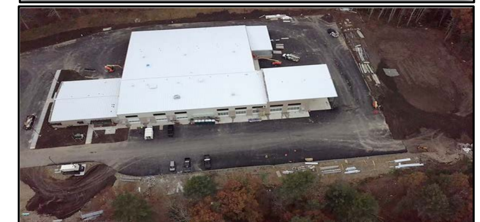
Top: Aerial View of the DPW Building Nearing Completion / Bottom: Looking West .