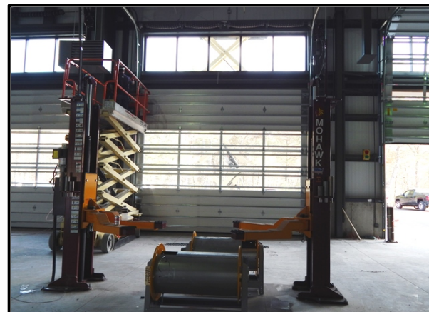
Mohawk Post Lifts Installed in Maintenance Garage.