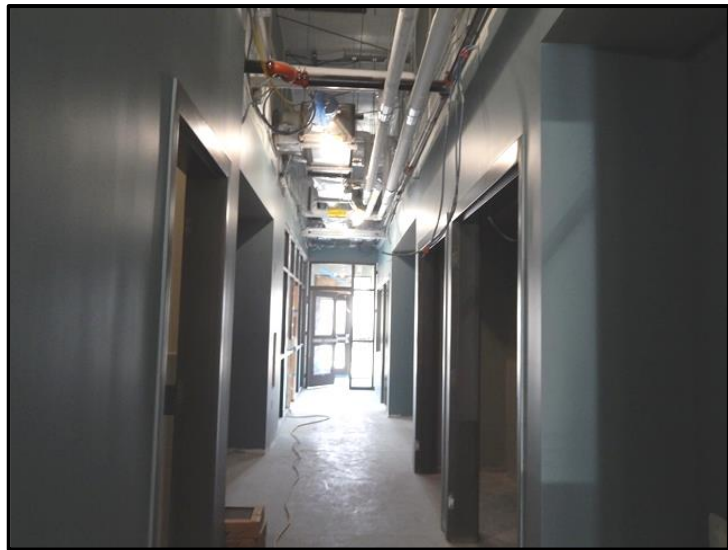
Interior Finishes Underway.

Insulation/Drywall Complete w/ Painting & Finishes Underway. Roofing/Siding Complete. Garage Lifts Installed. Phase II RAM Plan Drainage Work Complete.