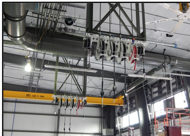
Fluid Hose Reels Installed in Maintenance Garage