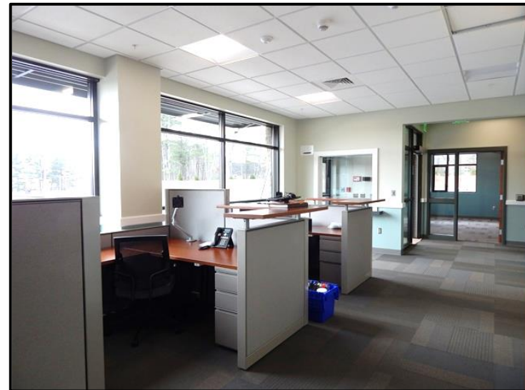
Admin Area Communications, Phones, and Furniture