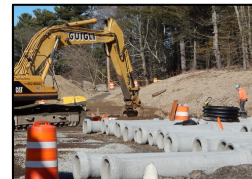
Drainage Piping Ready for Underground Installation