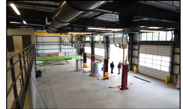
Garage Maintenance Bays Ready for Operation