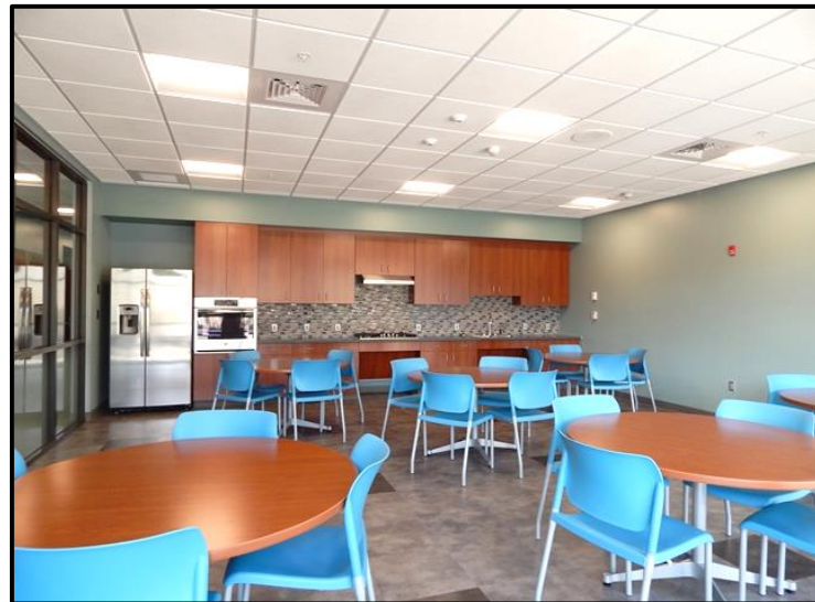
Furnished DPW Lunchroom