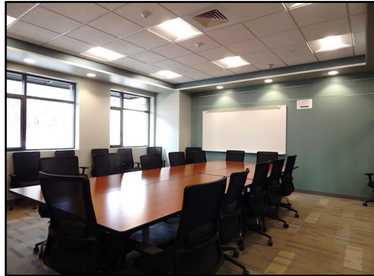
New Conference Room Furnished

Phase I: Temporary Certificate of Occupancy Issued. Punch List Work and DPW Relocation Underway. Phase II Site Work Continues.