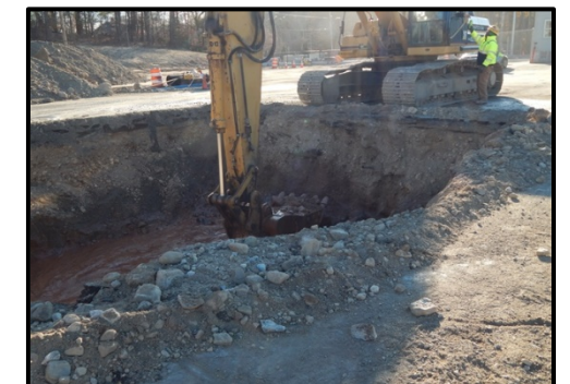
Work Continues for Phase II