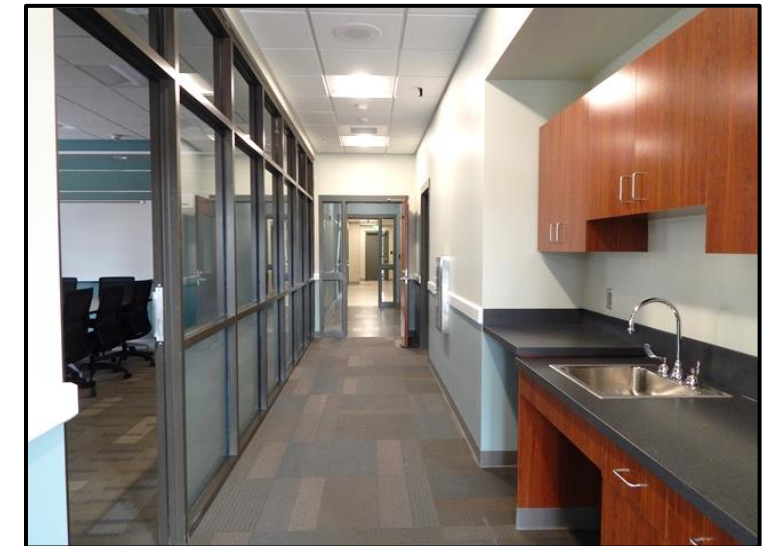
Main Hallway to the Garage Area