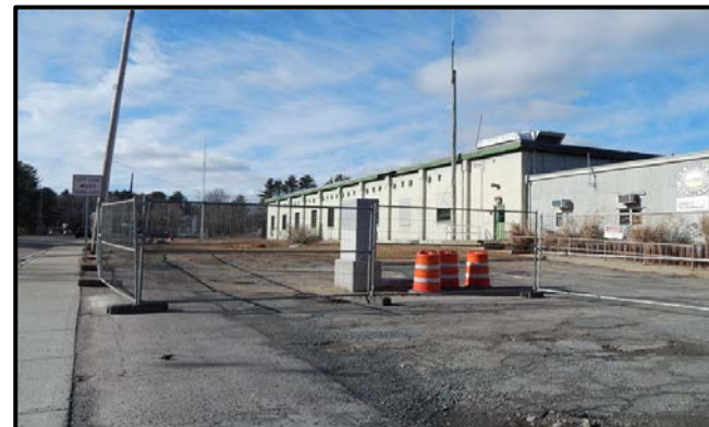
The Final Days of the Old Highway Garage