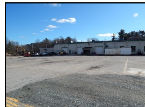
Old Highway Garage and DPW Relocation in Final Stages