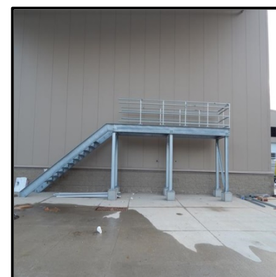
Cat Walk at Knock Down Pad.