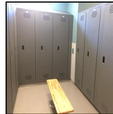
Men's & Women's Locker Rooms.