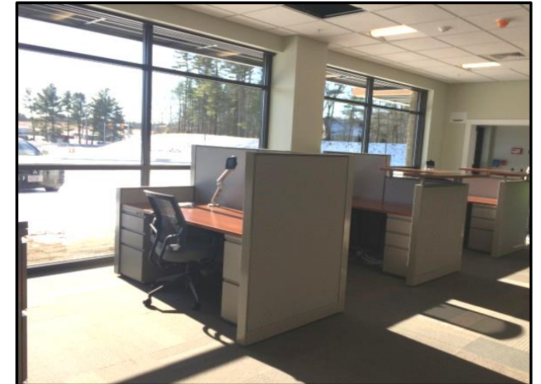
Front Admin/Reception Area.