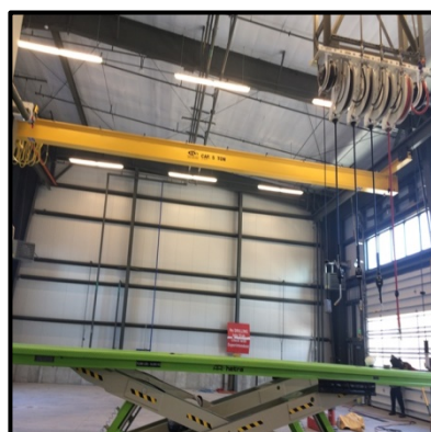
Bridge Crane & Vehicle Lift in Garage.