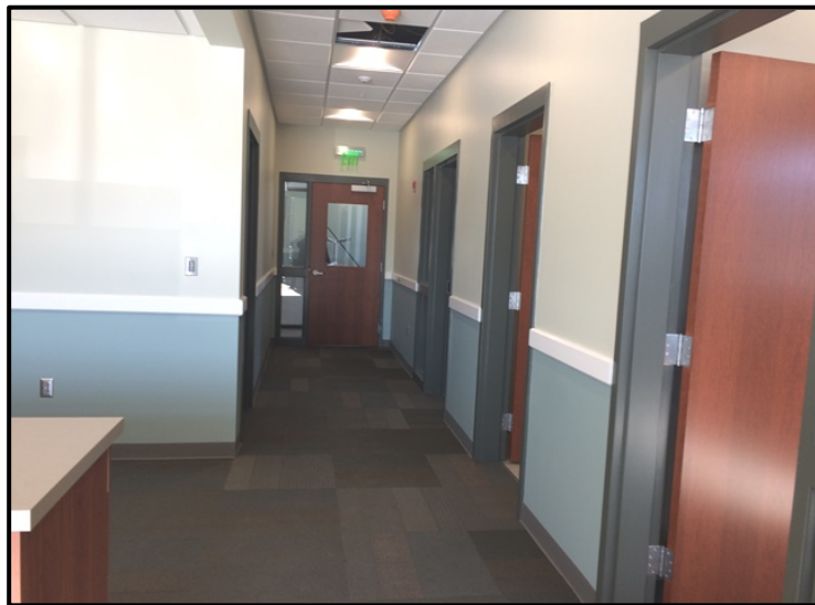
Side Entrance to Reception/Offices. Flooring, Signage, Finishes Complete.

Phase I: Building Nearing Substantial Completion Milestone In January 2018! M-P-FP Systems Sign-Offs. Punch List Items and DPW Relocation.