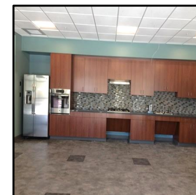
Millwork Installed & Breakroom Complete.